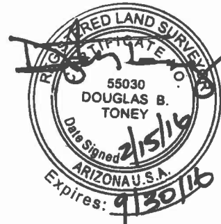
EXHIBIT 'A' SOUTHWEST GAS CORPORATION GRANT OF EASEMENT

APN 207-23-011K APN 207-07-005A P/O SECTION 28 (NO APN)